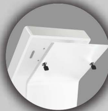
Anti-Theft Security with (2) locks

Perfect for waiting rooms, lobbies, and booths, this elegant floor stand is an addition to any types of business. An all-metal robust construction secured with a (2) key-lock system, gives the protection that your tablet deserves. Not only that, but cables and chargers can be easily route through its hollow body allowing for your devices to be on at all times. An included fitting system makes the perfect fit for any tablet within the enclosure.