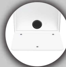
Heavy Duty Sturdy Stand