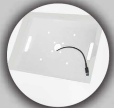
Flexible Interior Cable Management