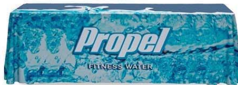
Back (4 sided)