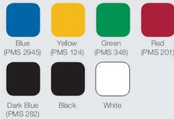
TABLE THROW CUSTOM (FULL COLOR)

Table Throws are a great addition to your trade show booth and are sized to fit standard 6ft and 8ft tables. Available in full graphic prints. There are two different styles available to suit your needs. The open back version has a full-length front and side material with a shorter edge on the backside. The full back version has full length material on the front, back and both sides of the table.