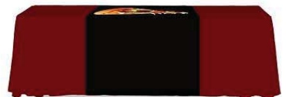
Back (4 Sided)