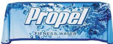
Back (3 sided)

Table Throws are a great addition to your trade show booth and are sized to fit standard 6ft and 8ft tables. Available in full graphic prints. There are two different styles available to suit your needs. The open back version has a full-length front and side material with a shorter edge on the backside. The full back version has full length material on the front, back and both sides of the table.