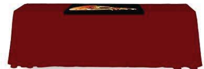
Back (3 Sided)