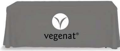
Table throws are a great addition to your trade show booth and are sized to fit standard 6ft and 8ft tables. Available with 1 or 2-color heat transfer graphic prints. There are two different styles available to suit your needs. The open back version has full length front and side material with a shorter edge on the backside. The full back version has full length material on the front, back and both sides of the table.