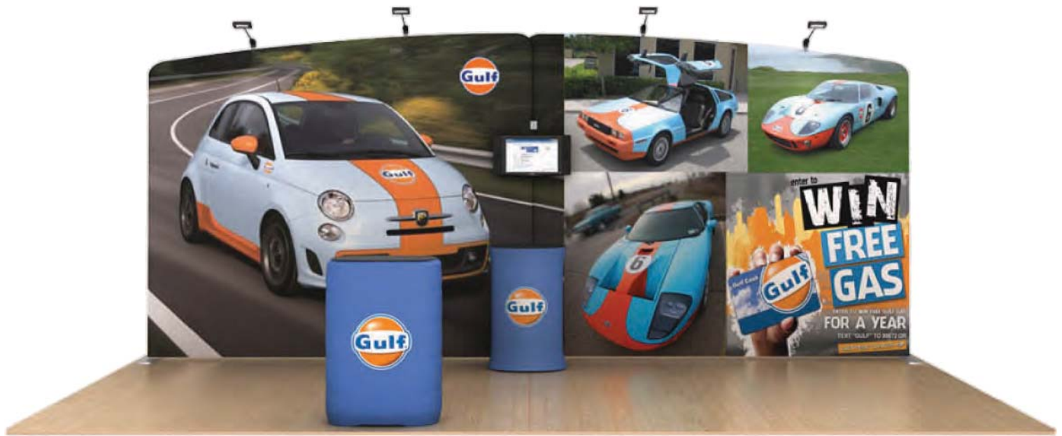
x1 Waveline Media Gulf 20ft Display with CA900 Counter and Mini Counter

20FT Waveline Media Display single or double-sided