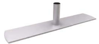
Media Support Feet WL-ES