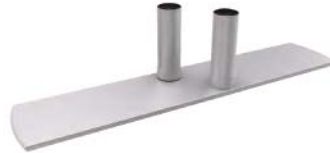
Media Support Feet WL-RS