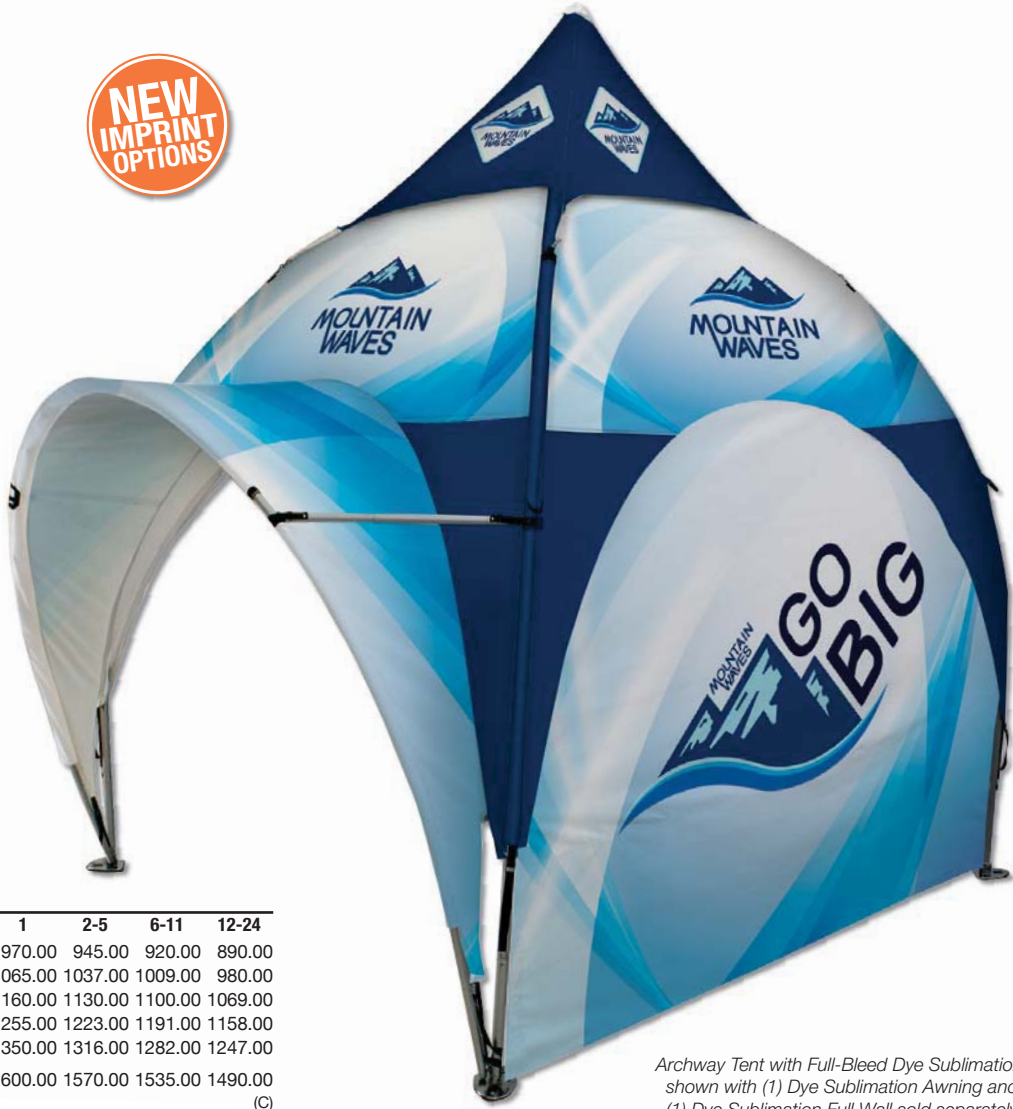
Archway Tent with Full-Bleed Dye Sublimation, shown with (1) Dye Sublimation Awning and (1) Dye Sublimation Full Wall sold separately. Contact factory for dye sublimation production lead time.