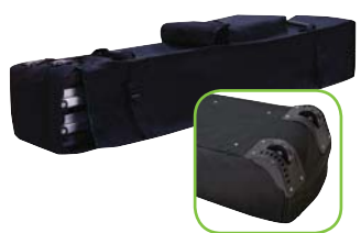
Soft Carry Case With Wheels