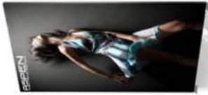
ASPEN Fabric Frame