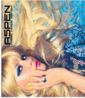
ASPEN Fabric Frame Backwall