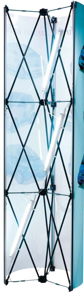
An inside look at the hardware and internal lighting system with one graphic panel removed.