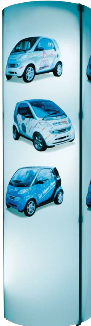
3 Square High Expand Tower shown above with optional florescent lights and Printed Graphic on Backlit material. 26" Wide Diameter x 88" High