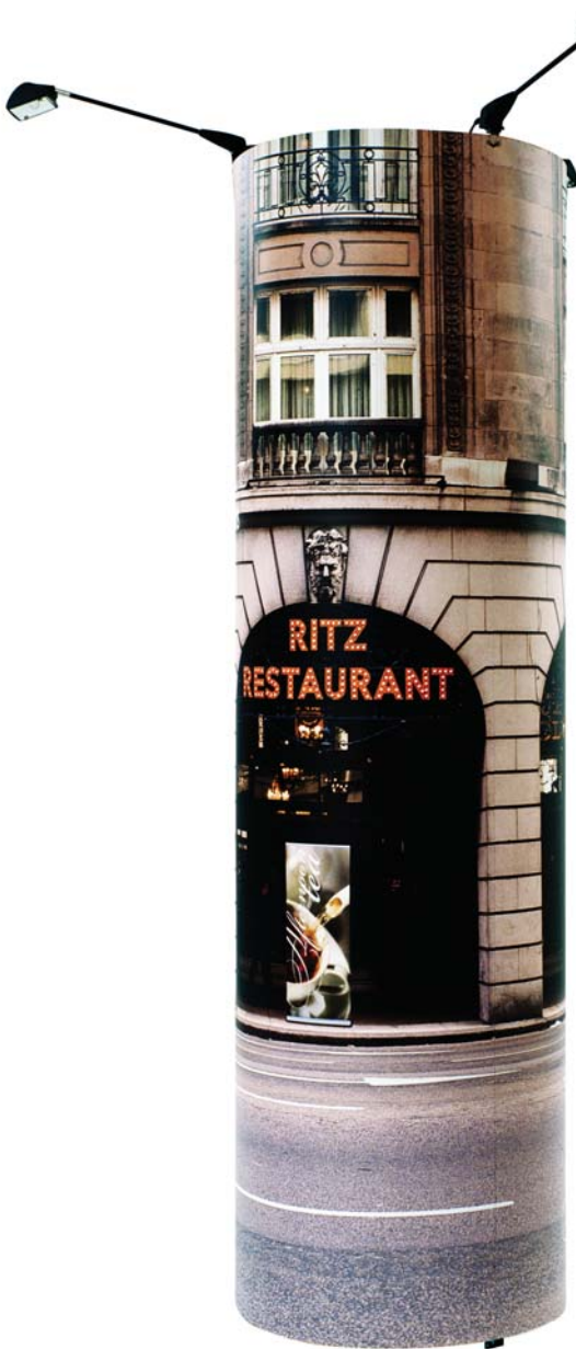
3 Square High Expand Tower shown above with optional spotlights and a printed InkJet graphic. 26" Wide Diameter x 88" High