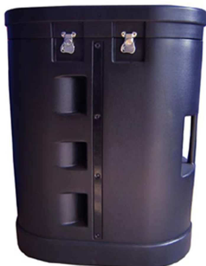
HARD PLASTIC TRANSPORT CASE WITH WHEELS