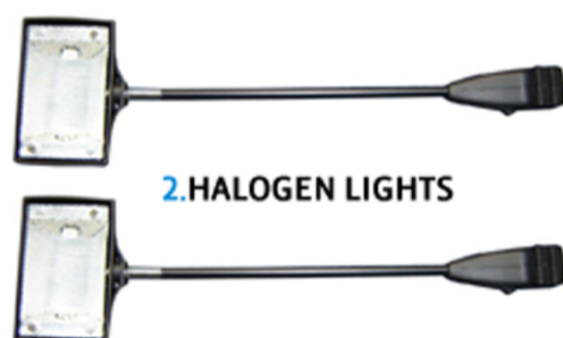
HALOGEN LIGHTS PACKING IN THE TRANSPORT CASE COVER