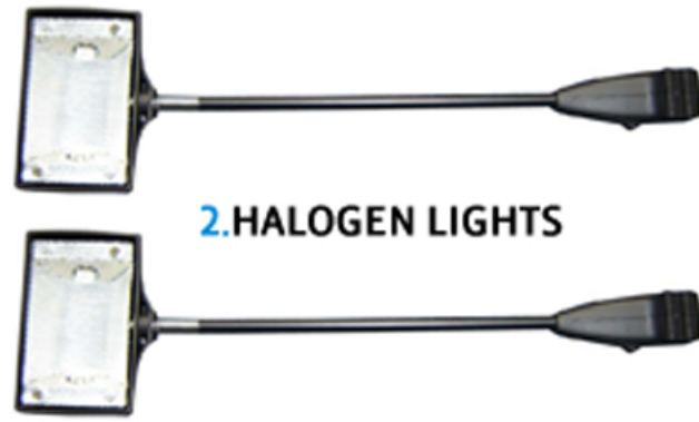
2. HALOGEN LIGHTS