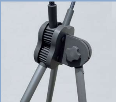
X-Display 100 connector