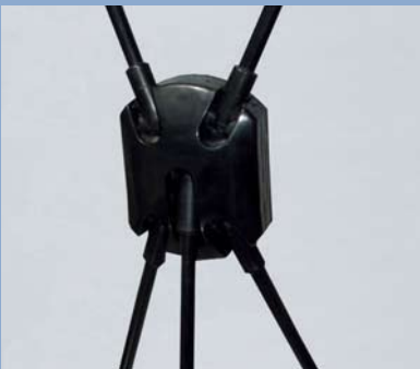
X-Display 200 connector