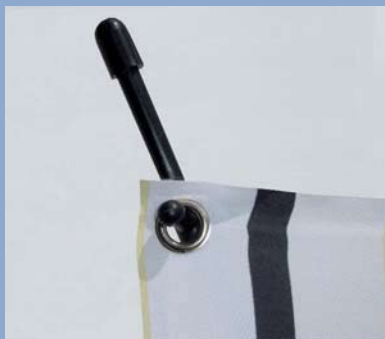
X-Display 200 closeup